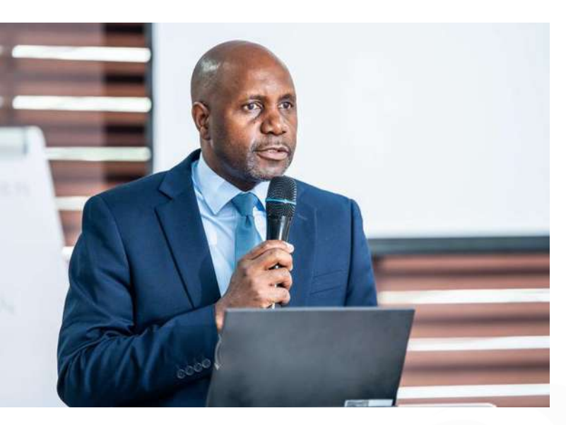
Harsen Nyambe, Director of Sustainable Environment and Blue Economy at the African Union Commission

and climate services for various socio-economic development areas including agriculture and food security, disaster risk reduction, water resources, health and energy, among others. Last week, from 04-06 September 2023, the African Union Commission, in collaboration with the Government of Kenya convened its inaugural Africa Climate Summit with critical Declaration on climate action. It is important that the ClimSA community in Africa acquaint itself of this Declaration.