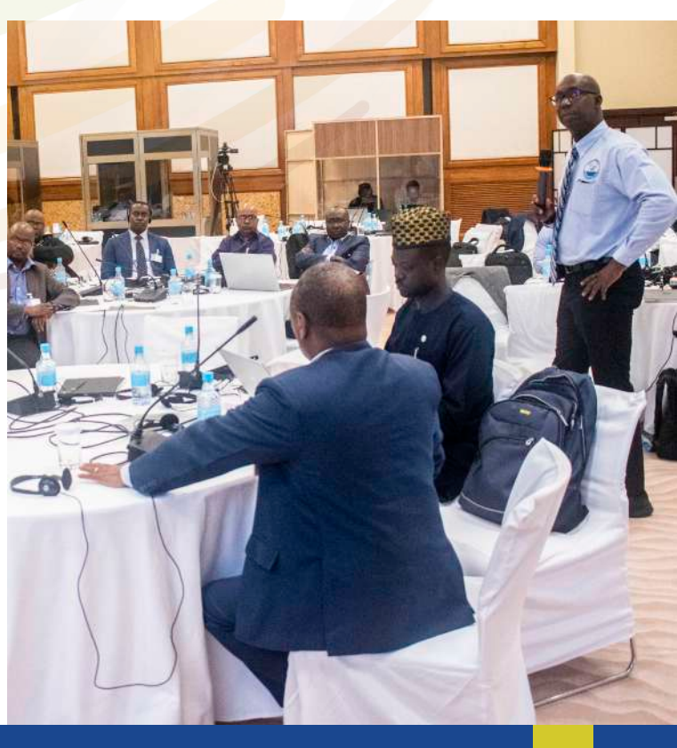
Proceedings of the first African and the third Global ClimSA Forum