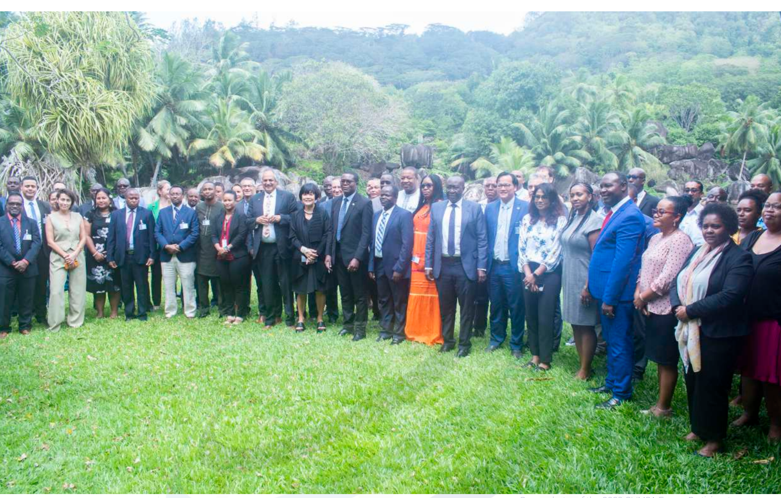
Group photo of the 2023 CLIMSA Forum Participants